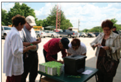
Dover members gather around the registration table for their shot to win the electric grill.