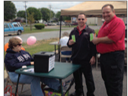
White House members receive CFL bulbs after registering to win an electric grill.