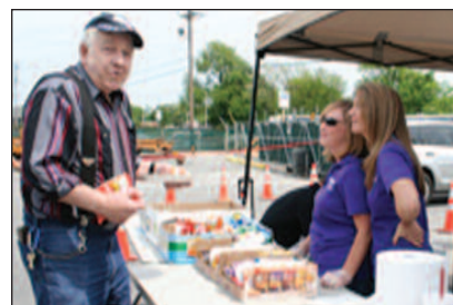
CEMC employees serve snacks and smiles on a beautiful, sunny day in Portland.