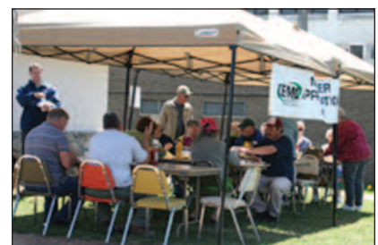
Despite chilly weather, Member Appreciation Day draws a big crowd in Ashland City.