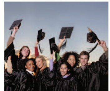
Scholarships: Six college scholarships worth $500 will be given away.