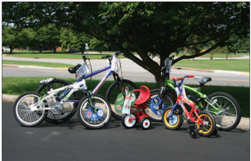
Some lucky children will be taking home brand new bicycles! The bikes range in size from a Radio Flyer tricycle for tiny tots up to a 24-inch six-speed mountain bike.

The Youth Corner will again include activities for children of all ages. Louie the Lightning Bug, face-painting and giant inflatables will be available for the entertainment of smaller children, and older kids can register to win bicycles and gift cards.