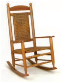
Front Porch Haven: Includes a pair of Hinkle rocking chairs

THE GRAND PRIZE: ENERGY STAR-rated washer and dryer with pedestals