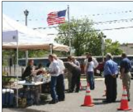
Day 6 – The wind keeps Old Glory flying proudly throughout our best-ever day in Portland. We have a plan to increase parking spaces when we come back next year!