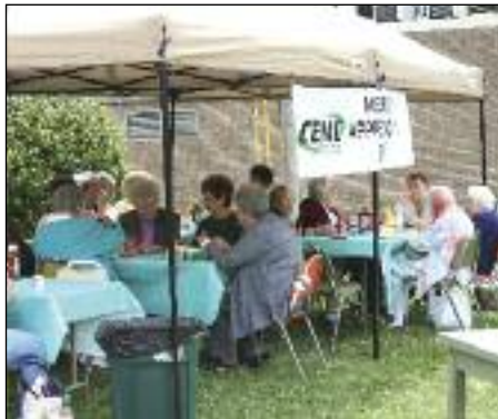
Day 3 – There is definitely a party atmosphere at our event in Ashland City — a steady stream of members plus live radio interviews made it a day to remember.