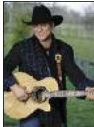
John Michael Montgomery headlines this year's Rivers and Spires Festival in Clarksville.

For more information, log on to www.riversandspires.com .